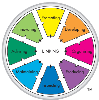
Types of Work Wheel