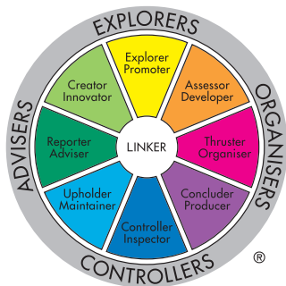
Team Management Wheel

Bringing the models together gives learners a greater understanding of how to lead and interact effectively as a team.